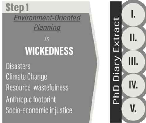
Figure 1 - Five PhD Diary Extracts to deal with the wicked problems of the environment.